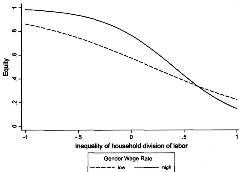
FIGURE 3. PREDICTED VALUES FOR EQUITY FROM MODEL 4 AS INEQUALITY OF HOUSEHOLD DIVISION OF LABOR CHANGES FROM LOW TO HIGH FOR EXTREME VALUES OF GENDER-WAGE RATIO (OTHER VARIABLES HELD AT THEIR MEANS).

powerful principle, followed by resource dependence and time availability. Nontraditional, independent women with high involvement in the labor market are the most sensitive with regard to the impact the actual inequality of household division of labor has on equity perceptions. Likelihood ratio tests show that the improvements from Model 0 toward Model 4 are all statistically significant.