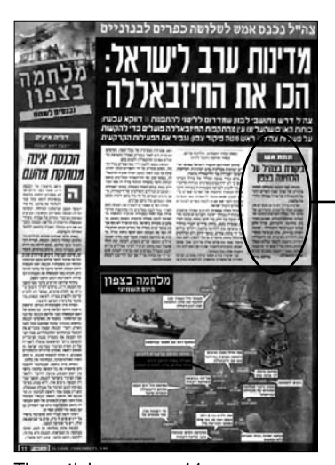
The article on page 11

23 TONS OF BOMBS ON HEZBOLLAH COMMAND BUNKER (main headline)