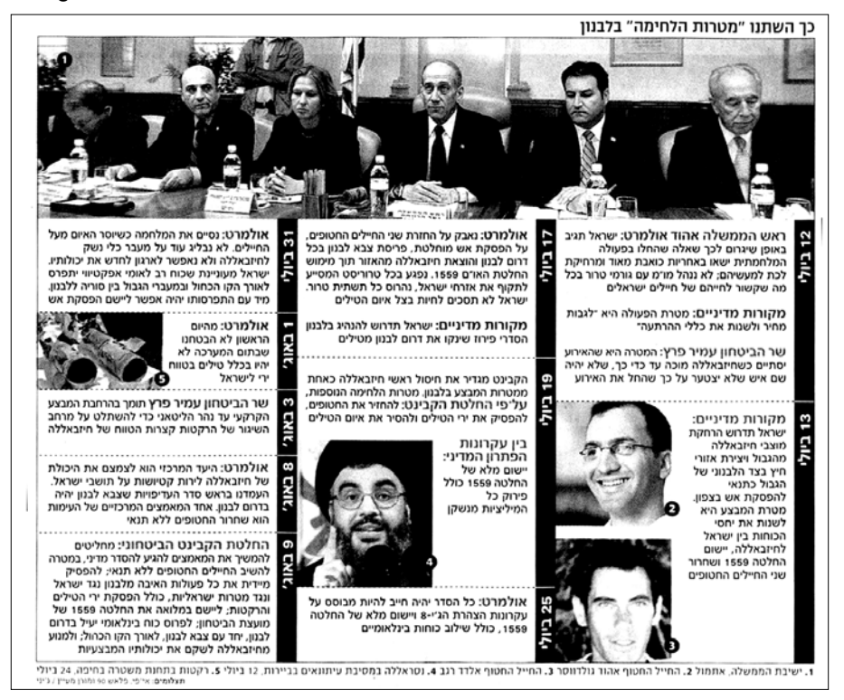
Diagram and timeline under the headline HOW THE "GOALS OF THE FIGHTING" CHANGED